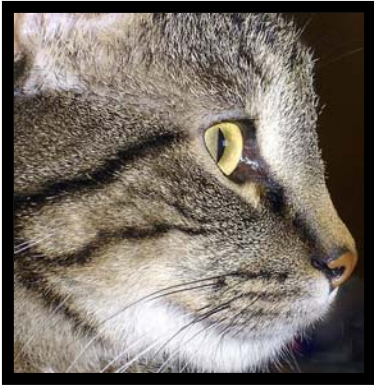
Oz poses for a quick photo op. between adventures.